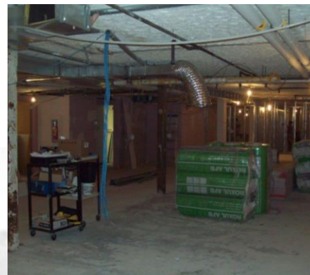
Before and after ... GDI Library, Prince Albert

In March, all work had been completed. These include new GDI Training and Employment offices, conference and coffee rooms, and the new library and resource space. The final inspection by the City was also completed in March. Feedback by students, staff, and the community in general has been very positive. 🌟